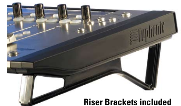
Riser Brackets included to increase height and viewing angle